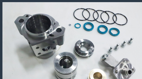
Seal kit, overhaul kit and repair set are available for maintenance ease, and to ensure extended service life of rock drills.