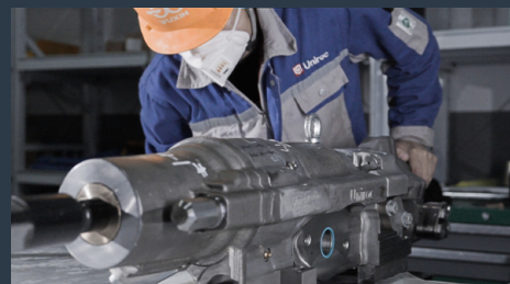
Service solutions ensure that rock drill performs at its best throughout its life cycle.