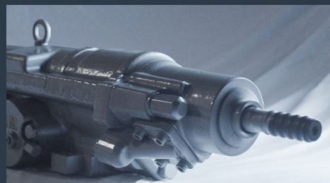
The design of heavy-duty front head is optimal for face drilling.