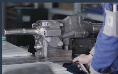
Specialized maintenance tools to ensure excellent performance and safe use of the rock drill.