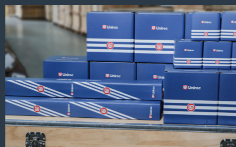
Two preventive maintenance packages are available to ensure rock drill service life.