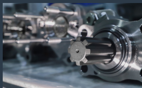
This rock drill has a heavy-duty design that makes it easy to drill even highly hard rock.