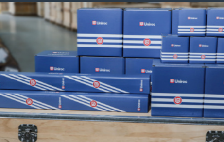
Two preventive maintenance packages are available to ensure rock drill service life.