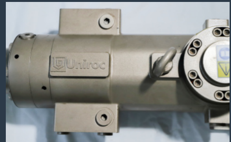
Superior material selection, low wear and tear, easy maintenance.