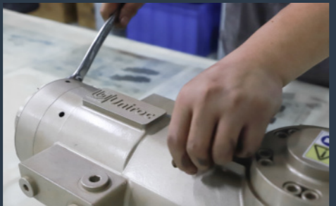
Specialized maintenance tools to ensure excellent performance and safe use of the rock drill.